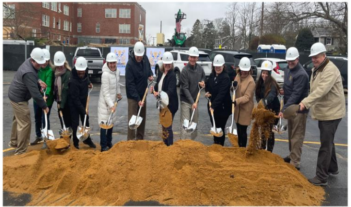
Official Tisbury Groundbreaking Ceremony