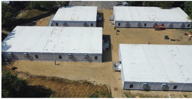
Once the temporary modular facilities are completed...