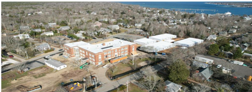
On the left, drone photos show the existing school with the temporary modular classrooms.